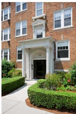
John Harvard Apts.